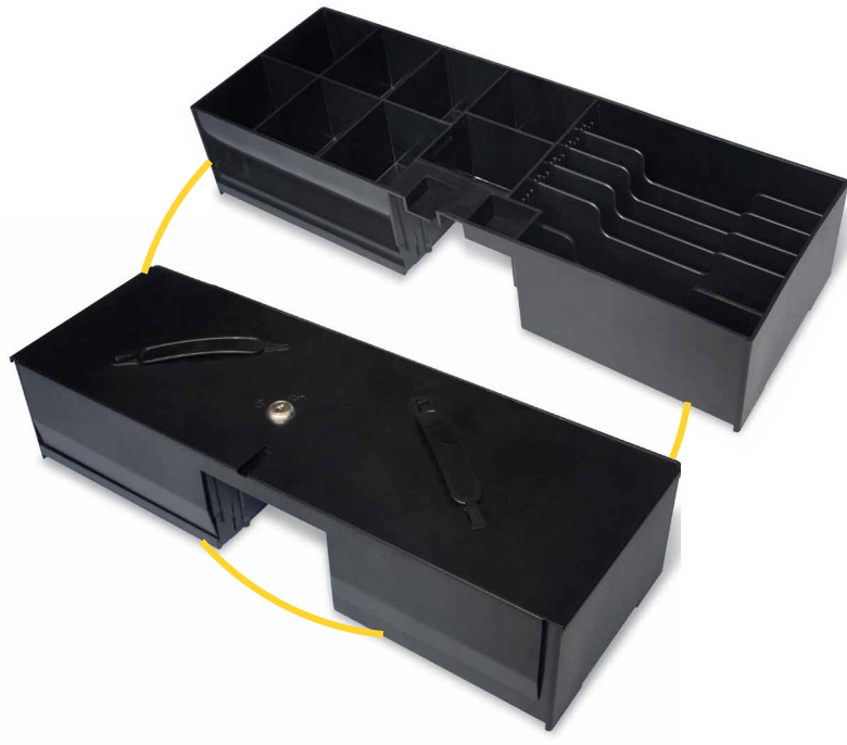
Unit with lockable tray lid