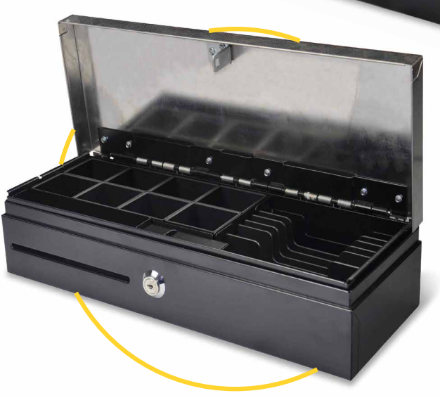
Stainless steel drawer front

It's the standard flip top cash drawer, which is very popular in compact retail environment, various interfaces available for POS terminal.