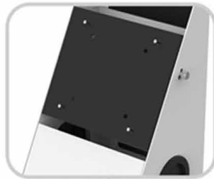
VESA standard mounting holes (75 x 75/100 x 100mm)