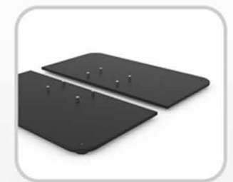
Base plate consisting of two pieces of high strength metal