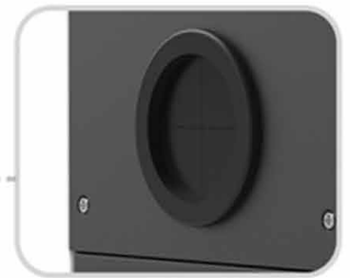
Cable routing holes