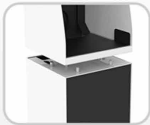
The upper and lower parts of the stand can be freely combined or separated for different usage modes