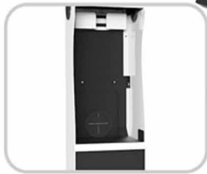
Printer space (L150 x W150 x H200mm)