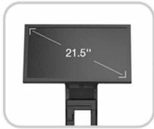
21.5" touch screen signage or custom, support landscape or portrait mounting